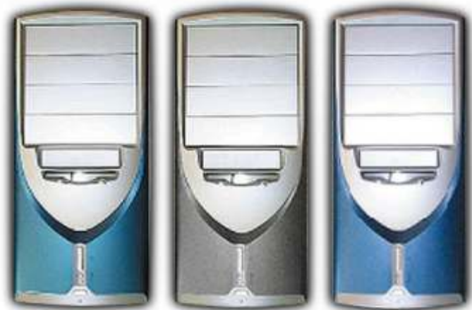
CX-2258/2259-01 CX-2258/2259-02 CX-2258/2259-03