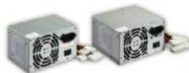
Switching power R:PX ; L:PM