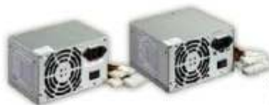
Switching power R:PX; L:PM