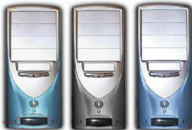
CX-2758/2759-01 CX-2758/2759-02 CX-2758/2759-03